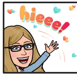
Wilson Room 14