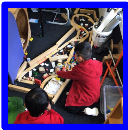
Identify our abilities, talents and interests

Children's development isn't organised into separate compartments. Their physical development affects their cognitive development, which is wrapped up in their social experiences, all of which interweaves with their feelings and emotions about themselves and the world around them. Sir Ken Robinson You, Your Child and School