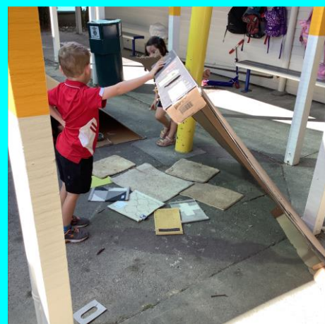
Identify our abilities, talents and interests