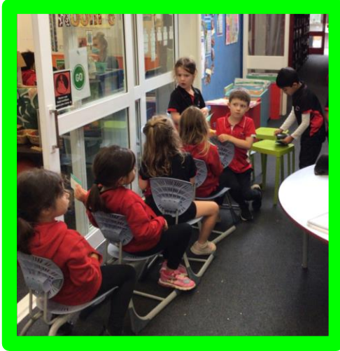
Manage our emotions to make good choices