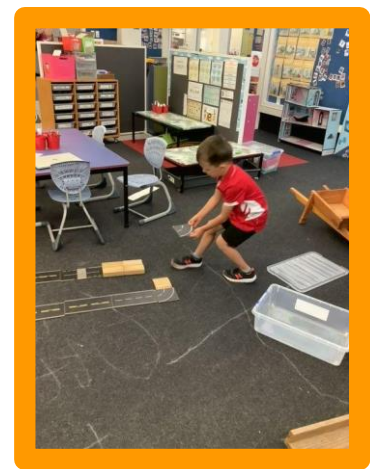
Reflect to find ways for to work better next time

Children's development isn't organised into separate compartments. Their physical development affects their cognitive development, which is wrapped up in their social experiences, all of which interweaves with their feelings and emotions about themselves and the world around them. Sir Ken Robinson You, Your Child and School