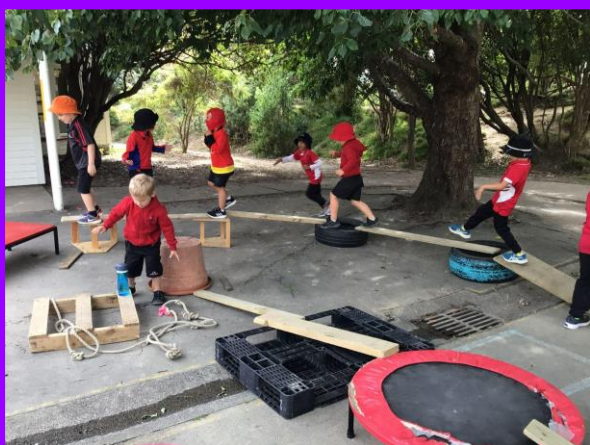
Accept our challenges