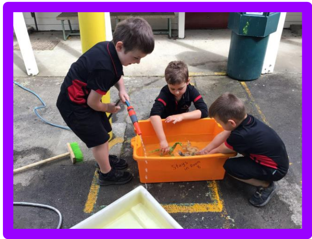
Identify our abilities, talents and interests