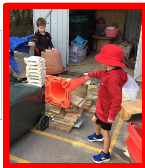
Reflect to find ways for things to work better next time