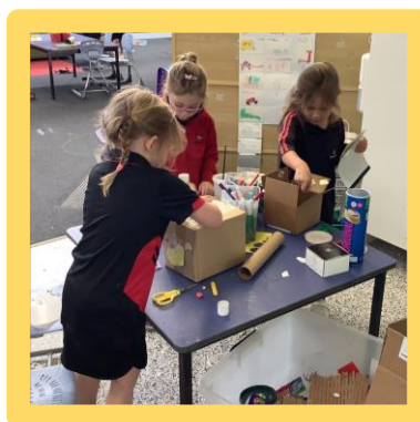
Own our words and actions