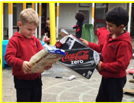
These Year 1 boys are on the case!