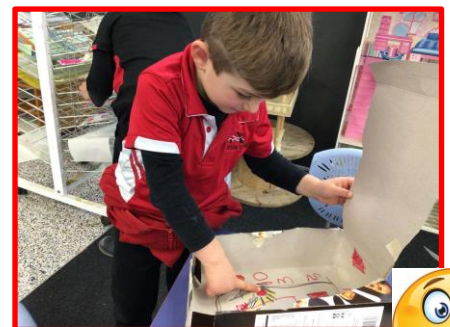
What happens if you push that button?