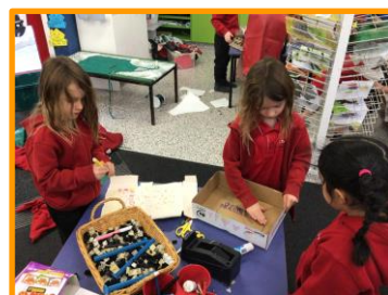
Children experimenting and creating spy gadgets.