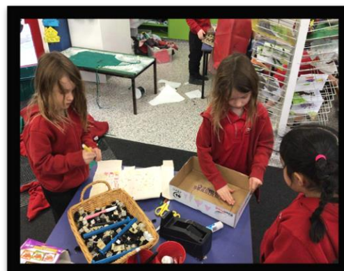
Children experimenting and creating spy gadgets.