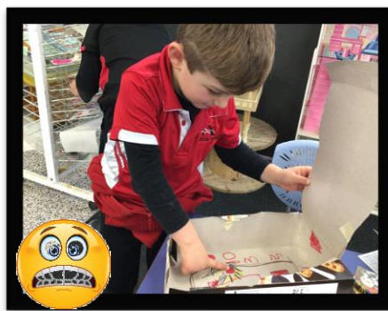
What happens if you push that button?