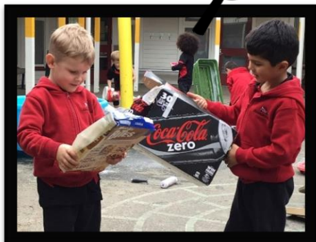
These Year 1 boys are on the case!