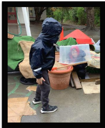
This hut's purpose is to protect these boys from the rain!