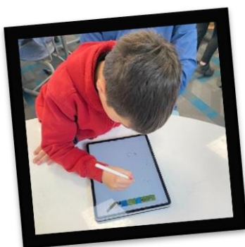
Jake using an iPad as a tool to draw pictures