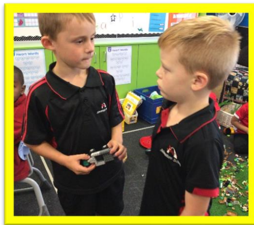
Poster children for the Adventure Way trait: Collaboration!

These two boys both wanted the vehicle, but there was only one. The teacher coached them through their options and questioned "what are you going to do?". After A LOT of debate, they decided they would share it.