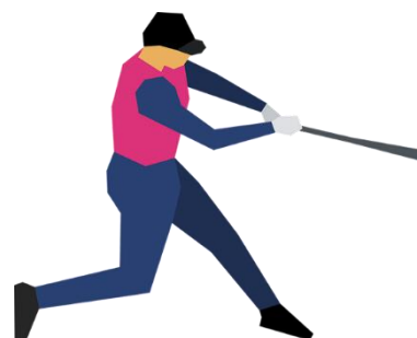
Ruma Rua Winners of the Nikau Trophy