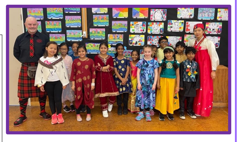
Students and teachers wore clothing that represented their own cultures.

During Term 3 Nīkau learnt about different celebrations from around the world. At the end of the Term our learning culminated in our own celebration and sharing of the many different cultures found in our own Syndicate. Each class also performed dances and songs from some of the cultures that we had learnt about.