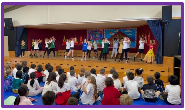
Room 5 performed a Diwali dance.