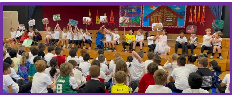
Room 19 performed the Kiwi 12 Days of Christmas.