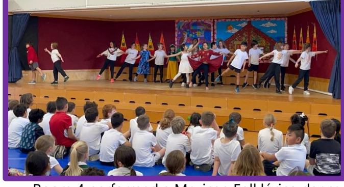
Room 4 performed a Mexican Folklórico dance.