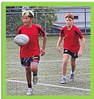
Huntley supporting TJ's break