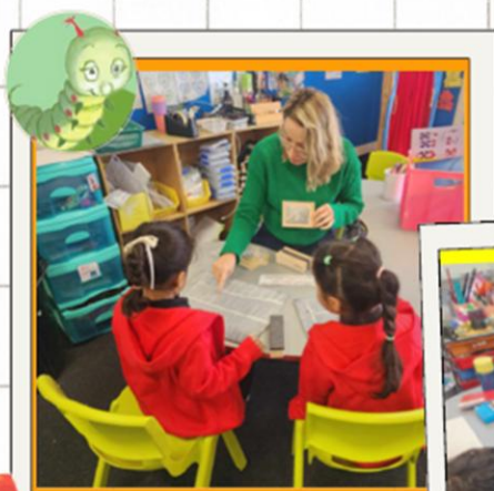
Small group Casey Caterpillar formation

Once children have mastered formation and letter to sound recognition for at least the first 8 letters we teach (s, m, f, a, t, p, c, l), they progress to writing in books during small group learning sessions. They write short dictated sentences using the sounds they know, and practice the use of capital letters, finger spaces and punctuation.