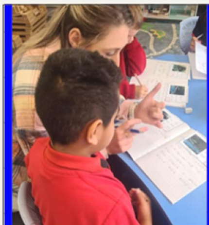
Teacher supporting child during independent writing time

*Please note that these expectations are based on a child's typical progress, but many things can have an impact on the rate of progress i.e. neurodiversity, irregular attendance, preschool skills (fine motor, gross motor, auditory awareness, vocabulary and oral language skills). We have recently started offering a learning pack to support foundational learning skills. Please contact the school office if you are interested in purchasing this pack.