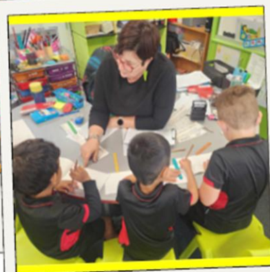
Small group dictated sentence writing 1.