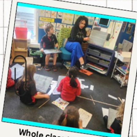
Whole class Handwriting Practice

As children build their letter to sound knowledge, we practice forming these letters using our Casey Caterpillar program. Fluent, legible handwriting is a priority because it supports children's ability to express their ideas clearly and confidently.