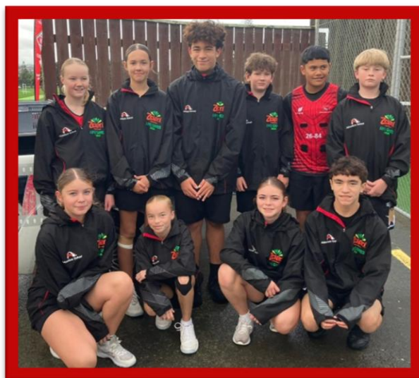
The Pulse team in front of the Toyota BBQ trailer

Thank you to the following local businesses who are supporting the Pulse's AIMS Games Campaign-